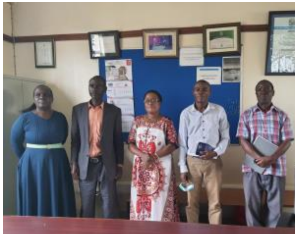
6 - MOCCA study patient representatives after the meeting with the INTE-COMM study team at TASO, Uganda.