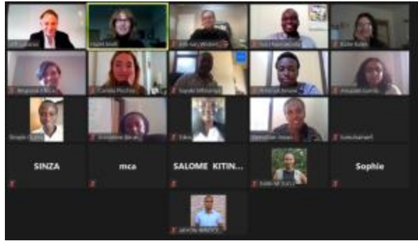
10 - Social media training from IS Global in January 2021