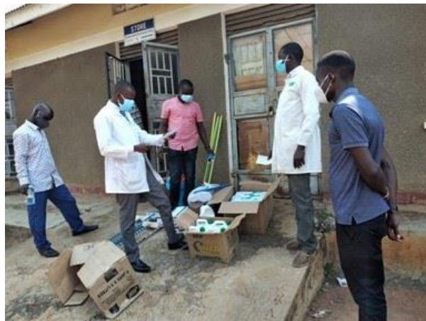
37 - A facility in Mayuge district, Uganda, receiving their PPE