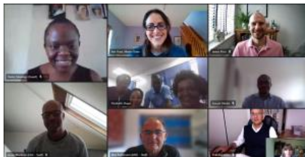
9 - Virtual training with the Tanzania team on process evaluation, June 2021