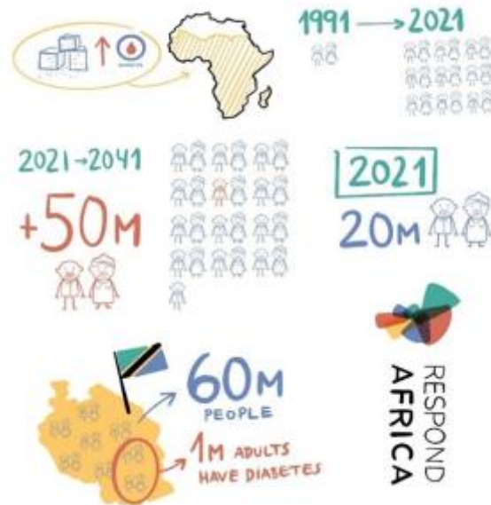
15 - A still from the upcoming META 3 film

The idea to do this came from our funder, EDCTP, and follows our initial animated film which was very well received. We look forward to disseminating the animation to patients, policy-makers and funders in January.