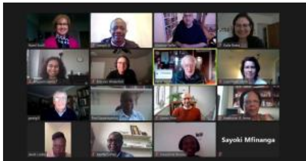
35 - Members and observers at the International Steering Committee on 20 January 2021

The International Steering Committee met virtually in January 2021 and continued to communicate online throughout the year. We hope to be able to meet in person in 2022!