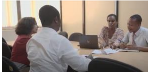
19 - Behind the scenes view of filming taking place in Tanzania