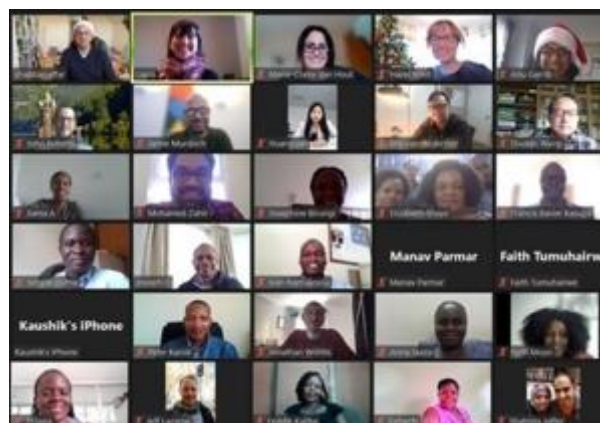
38 - Some of the friendly faces of the Respond Africa partnership!

Even Zoom was happy, allowing nearly 30 people to turn their cameras on for a photo without freezing - a Christmas miracle!