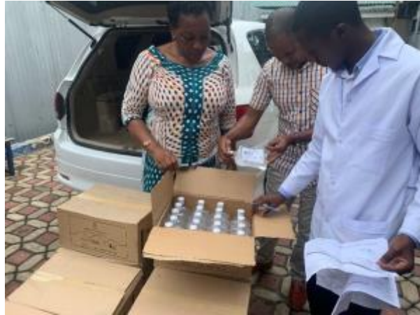
36 - The team arranging delivery of hand sanitiser in Tanzania