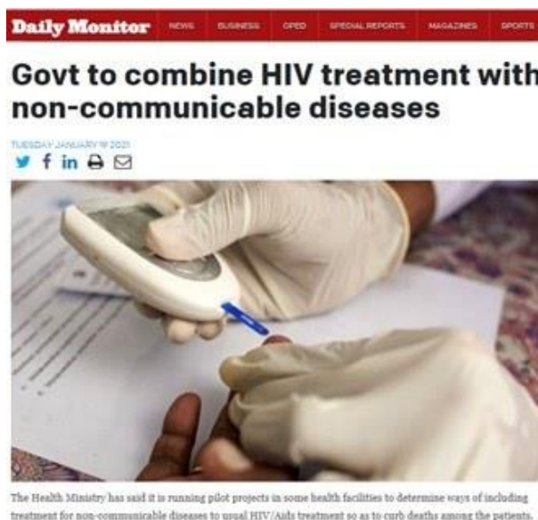
11 - Integration featured in the Daily Explorer

The article can be found here https://www.monitor.co.ug/uganda/news/national/govt-to-combine-hiv-treatment-with-non-communicable-diseases-3261696